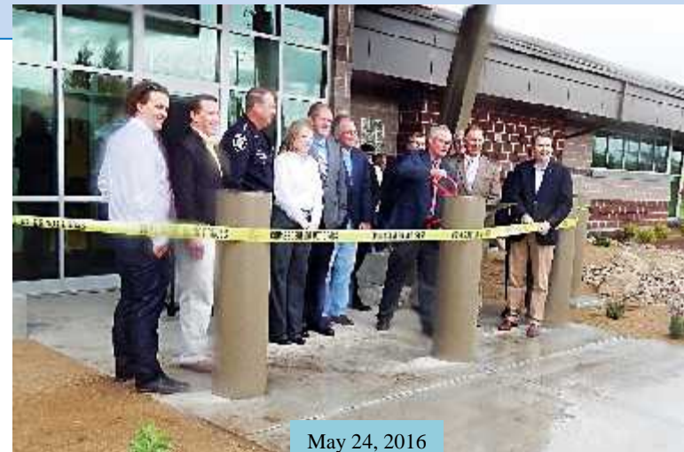
May 24, 2016