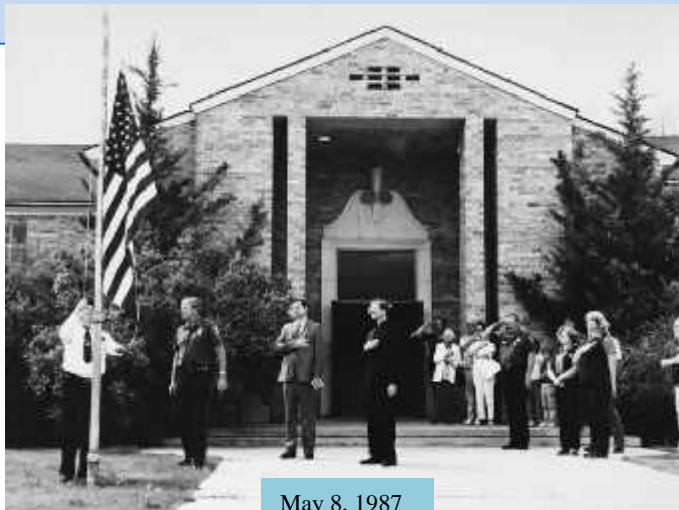
May 8, 1987

The Operations Division handles all crime calls and traffic accidents within the City limits, as well as routine police matters which include animal calls, funeral processions, parades and much more. Our average response time to emergency calls is three minutes from the time the call is dispatched to the officer's arrival.