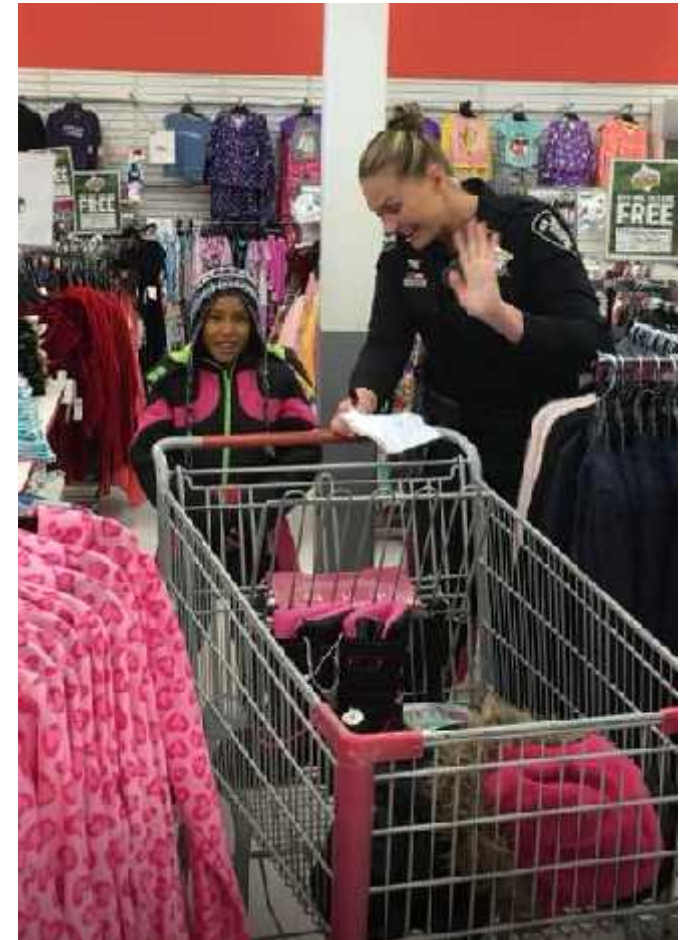
2017 Shop With a Cop Event